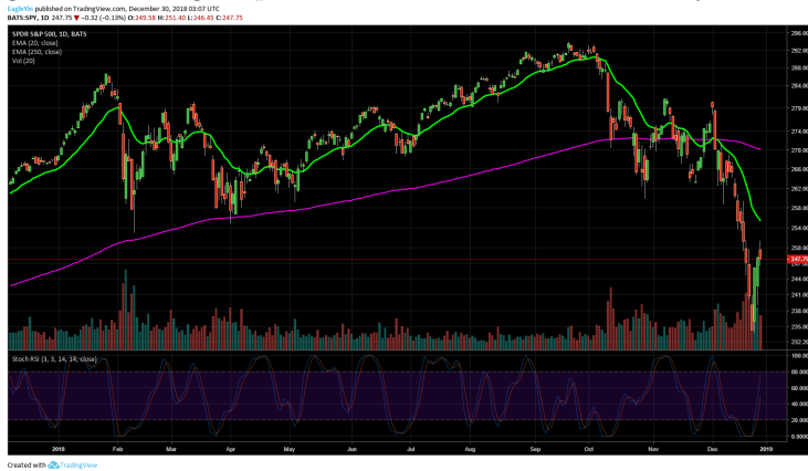
Figure 1: This figure presents candle stick of the entire year of 2018.

Looking back at 2018, I still could not believe I started this year shorting the entire market. I flipped sides back and forth for 5 times (the first 3 I closed books with almost 50% gains and the last 2 I gave back almost half of gains away). It was certainly interesting reading the history of Battle of Verdun that was fought between French and Germany in 1916 during WWI. However, it was rather brain-hurting than amusing when I was in the battle than reading it.